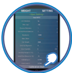
Using APP ScaleConfig to Calibration