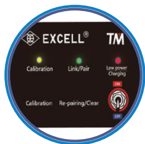
Three types of status indicators