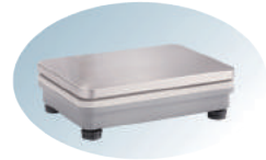
K: 322 x 242mm