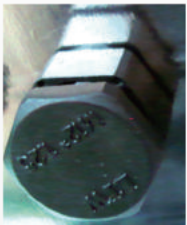
▲ QWS: Pressure Relief Valve