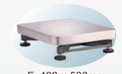
F: 400 x 500mm 420 x 520mm