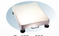
D: 420 x 520mm