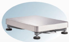
L: 460 x 600mm