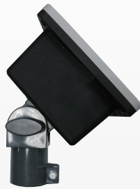
▲ GWS: Sleeve Connecting Stand (Standard); U Shape Stand (Option)