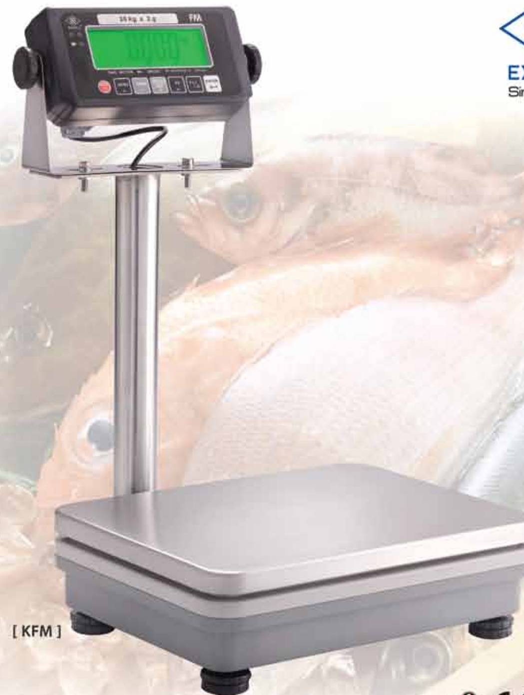
[ KFM ]